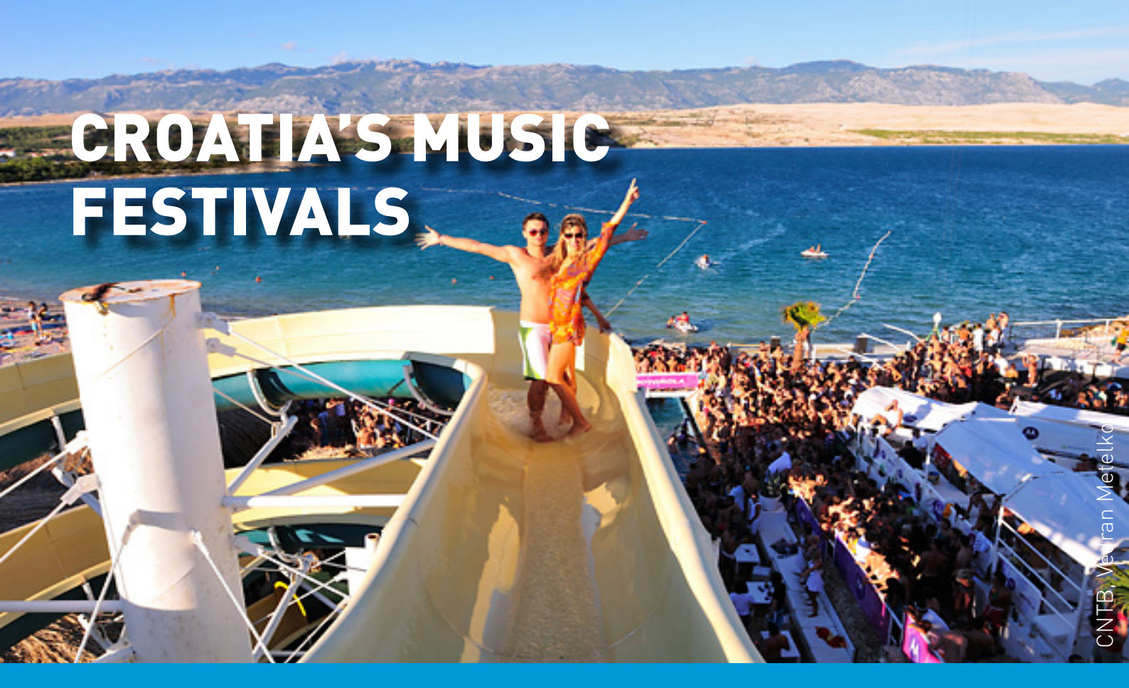
Top festival destinations, all summer long

Croatia has become one of THE music festival destinations, establishing its name over the last decade for independent, different and outstanding events, with some of the biggest names and a free, welcoming spirit and stunning locations.